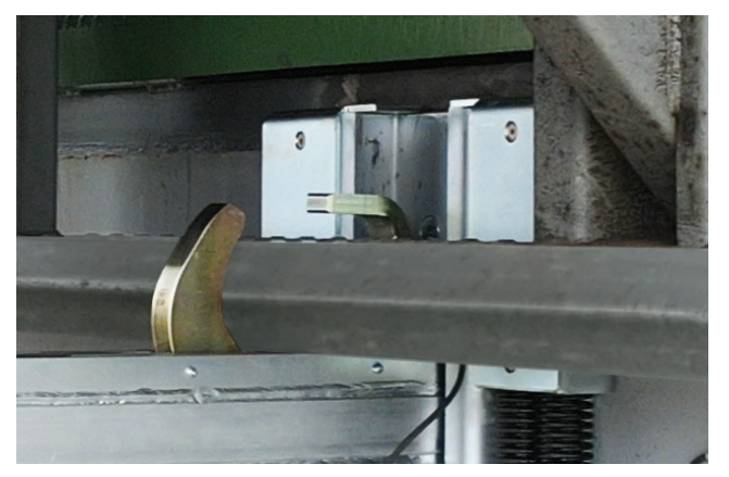
Four Sided Bar Capture