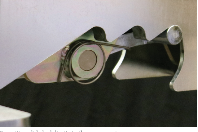
3-position slide lock limits trailer movement