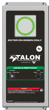
Control panel (10"W x 21"H x 7"D)